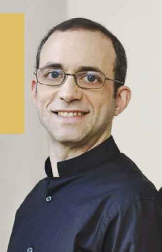
JONATHAN BISS, PIANO MARK STEINBERG, VIOLIN

MAY 19–22 JONATHAN BISS & MARK STEINBERG